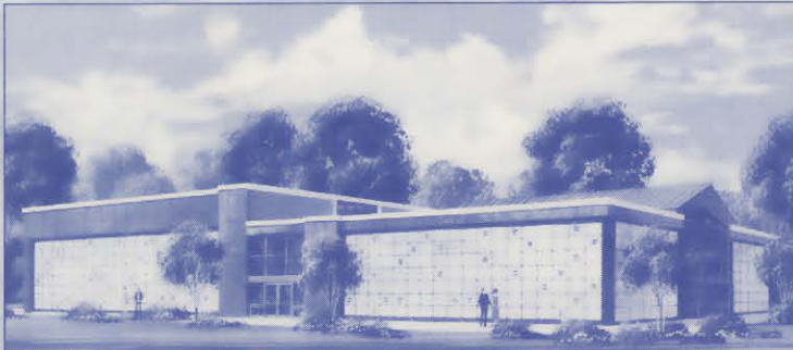
NEW "GATE OF HEAVEN" CHAPEL MAUSOLEUM PHASES I & II (2,350 CRYPTS & CREMATION NICHES)

ONE OF THE BEST MAINTAINED MEMORIALIZATION FACILITIES IN THE COUNTRY