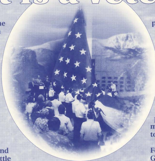
MEMORIAL DAY 1993 VETERANS HONOR COURT