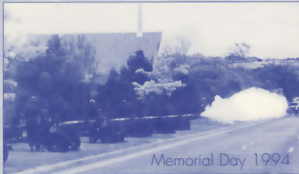
Memorial Day 1994

Crypts With Italian Marble or Granite For Above Ground Burial